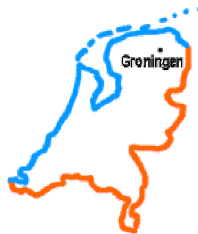
Location of Groningen in the Netherlands

Venue: Remonstrante Church, Coehoorsingel 14, Groningen (Netherlands) No entry fee – 9.30am to 5.30pm